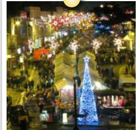
Stratford Christmas lights