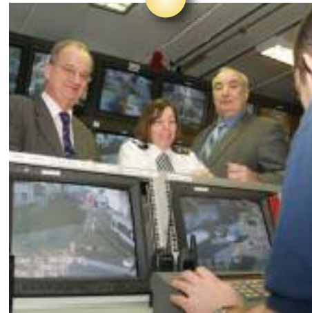
CCTV Control Room