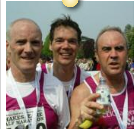
Shakespeare half marathon