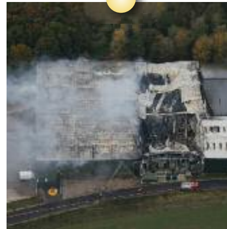
Atherstone warehouse fire