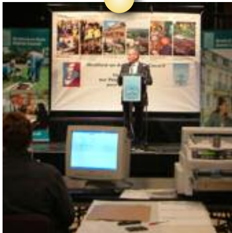
Electronic Vote Counting