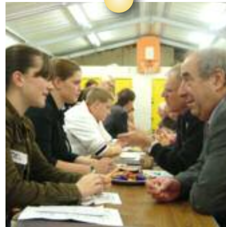
Councillor Speed Dating during Local Democracy Week