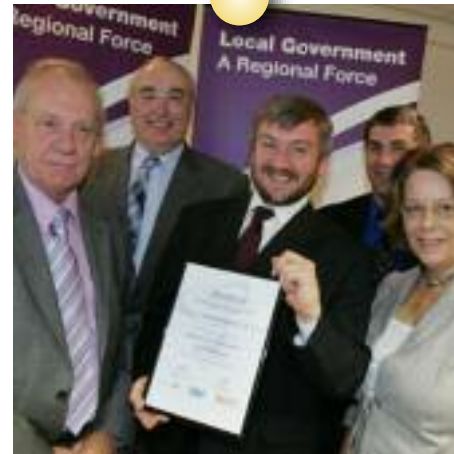
West Midlands Member Development Charter