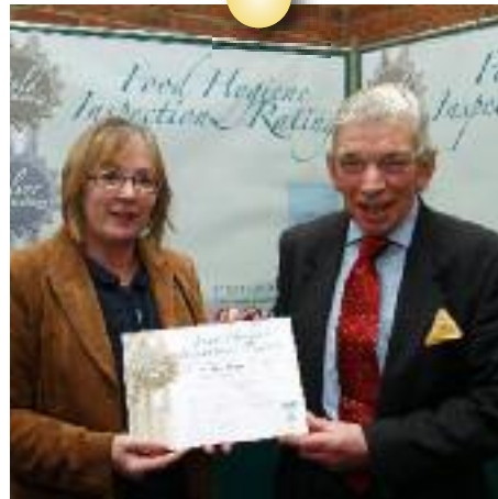
Scores on the Doors