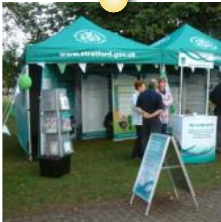
Stratford Food Festival