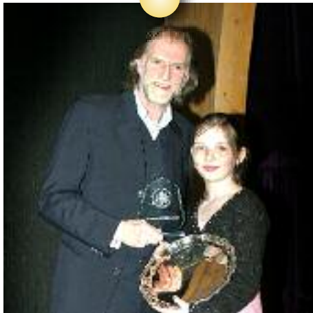
Sports Awards Ceremony