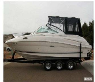
240 SUNDANCER COMPLETE WITH CANOPY AND FRAME

is approximately £2000 is unique to this type of boat and was possibly taken to order.